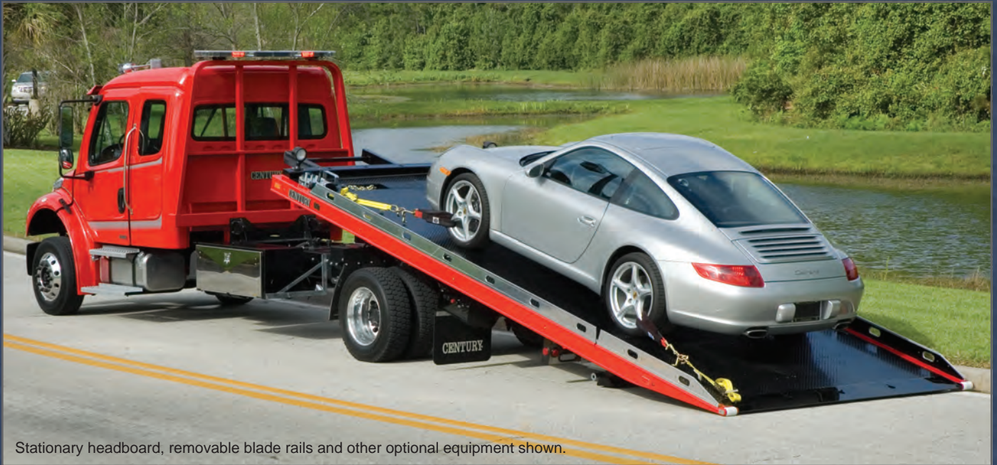
Stationary headboard, removable blade rails and other optional equipment shown.

At Century, we feel that "Keeping up with the Industry" is nothing but an excuse. If we can't produce a product that is superior to everything in its class... then you won't see our name on it. Our Car Carriers are a perfect case-in-point. They possess every standard feature that you would expect from a World Leader, brought together in a sleek, attractive and durable package. With an independent wheel lift system, positive lock down, extra-low loading angle, and easy one-man operation, Century Carriers have driven past every limitation that has held "The Industry" in check. Century leaves no room for argument.