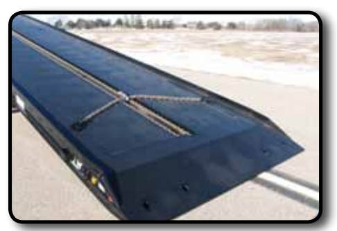
Bridle Chain w/Twist Locks