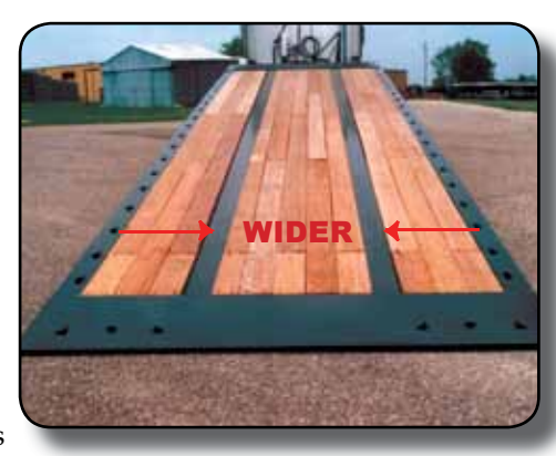
• Wider Main Beams Wider Undercarriage Wider Tilt Cylinder Mounts Wider Outer Beam Pivot Point

The Model 455 rounds out the 400 series with triple axles and 55 ton capacity. Lengths available are 48′, 50′, 53′ and California legal 50′. To maximize the load capacity, the 455 is STANDARD with a 60″ axle spread.