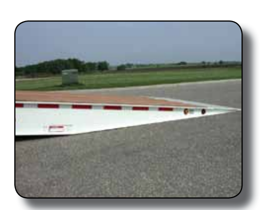
• Rigid Flat Approach Plate Is fully supported by the four main beams of the trailer. It allows the entire trailer bed to become one single, even plane for safe loading from the ground

Standard tiedowns are combination stake pocket "gotchas" for securement of equipment. The standard slope roller and steel wear plate act as a barrier against rubbing and prevent extra wear on the winch cable. The exclusive Landoll traction plate provides superior grip when loading onto the upper deck.