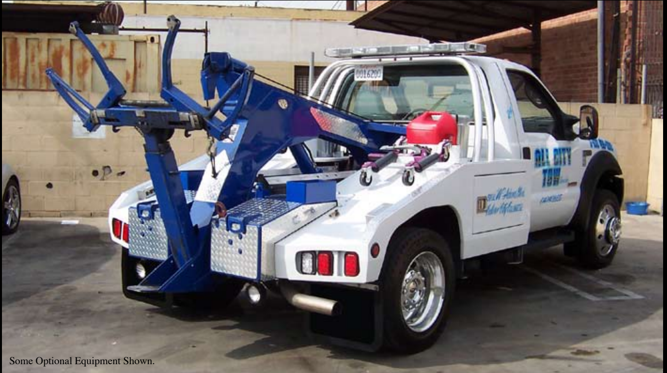
Some Optional Equipment Shown.

The Eagle EB2 is a versatile towing and recovery unit. Its patented claw system provides you with a self loading wheel lift without unnecessary additional hydraulic components that increase maintenance and down time. Hook ups can be achieved in seconds. And since the Eagle claw works from the inside of the tire, curb side hook ups can be achieved even when there is no clearance between the tire and curb. The EB2 with its 8,000 lb. hydraulic winch and cross bar sheave attachment will allow you to handle a variety of recovery situations. For more information on the EB2 contact your local Eagle distributor.